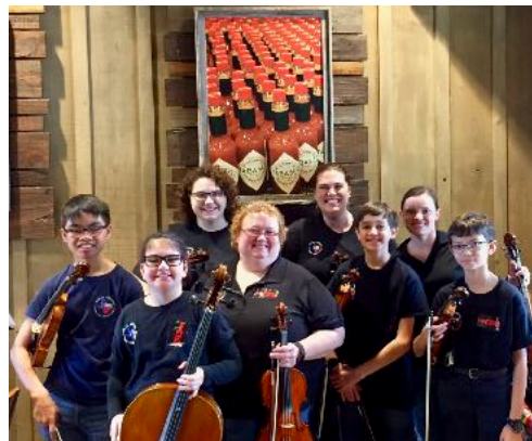
Tabasco Factory, Avery Island, Louisiana