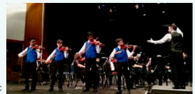
Onstage with the Pasadena Philharmonic