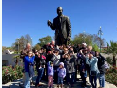
Louis Armstrong Park, New Orleans, LA

A concert tour around Texas, ending with McKenzie's Fiddle & Suzuki Workshop in Burleson, TX